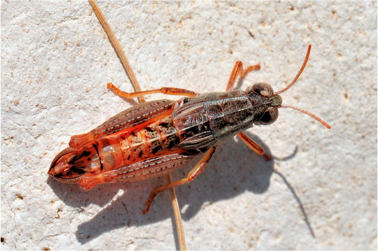
Fig. 1: Male of P. cristatus , 2 September 2011, Slavnik.