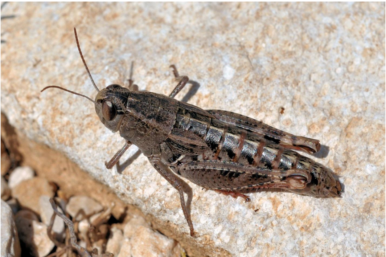
Fig. 2: Female of P. cristatus , 2 September 2011, Slavnik.