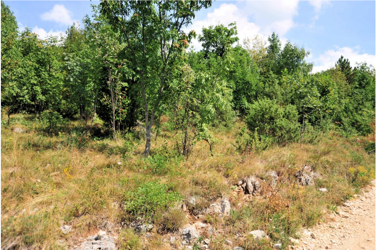
Fig. 3: Habitat of P. cristatus , 2 September 2011, Slavnik.